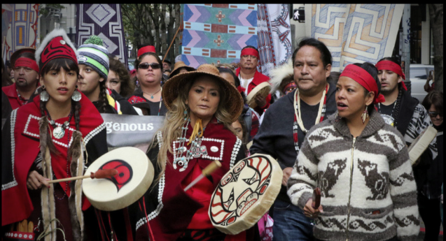
Indigenous Peoples Day celebration. October 10, 2016. Seattle, Washington. The Seattle Times .

Invisibility fuels racism against Indigenous peoples